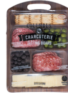
COLUMBUS CHARCUTERIE TASTING BOARD