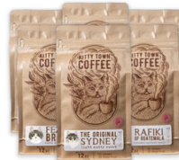
KITTY TOWN COFFEE CO.