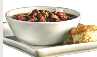
CHILI NIGHTS Thursdays | 5:30 - 7:30 pm