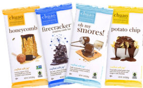
CHUAO CHOCOLATIER CHOCOLATE BARS