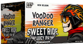
NEW BELGIUM VOODOO RANGER SWEET RIDE IPA